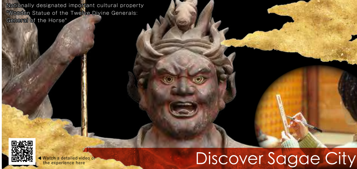
Nationally designated important cultural property "Wooden Statue of the Twelve Divine Generals, General of the Horse"

Watch a detailed video of the experience here