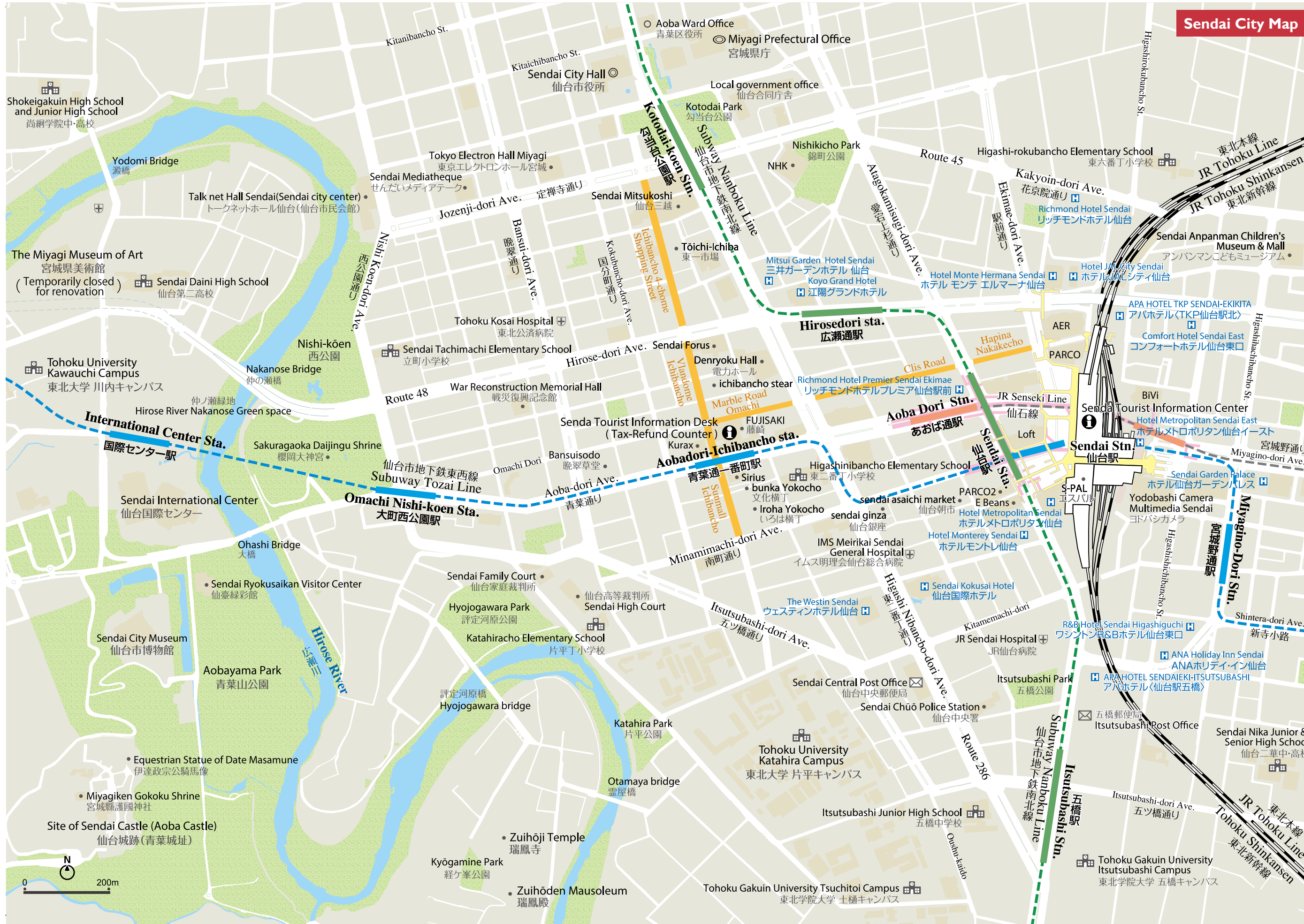
Sendai City Map